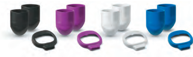
Welch Allyn Pocket LED Handle Bumpers and Otoscope Window Bumpers

Customise with our accessory kit* to mix and match your look.